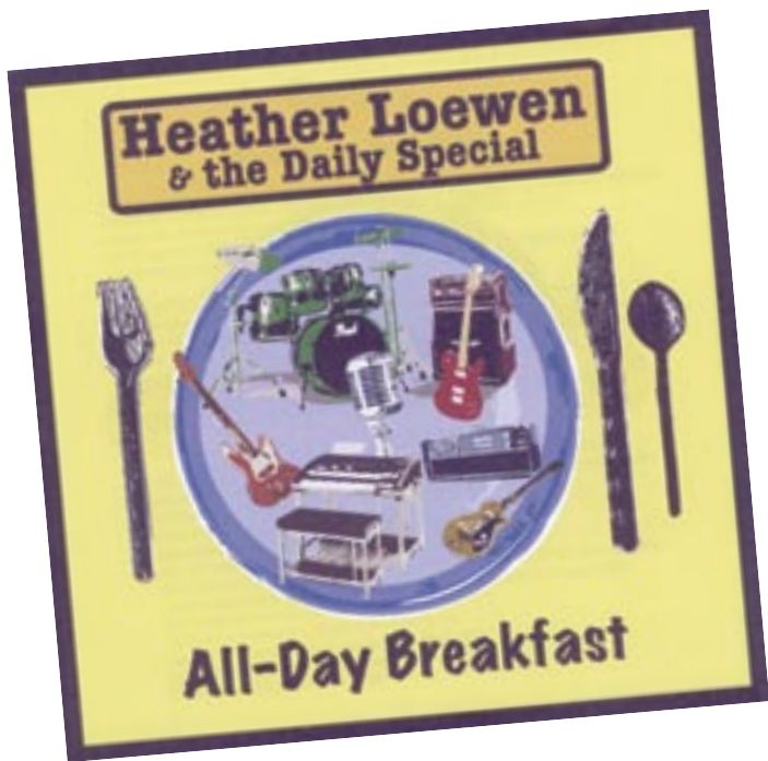
Heather Loewen & the Daily Specials, All-Day Breakfast is a full-meal deal.

After a successful CD release party a couple of weeks ago, Heather Loewen & the Daily Specials, All-Day Breakfast has hit the shelves.